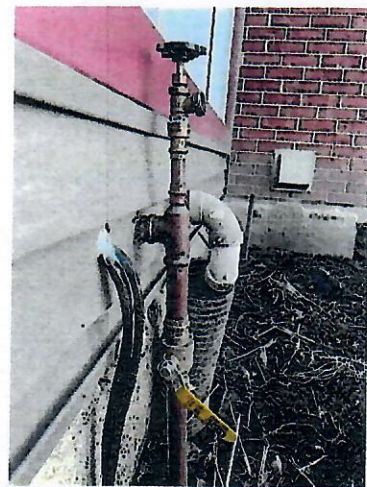
Ball Valve Winter Position