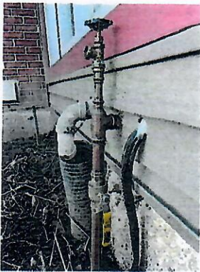
Ball Valve OPEN