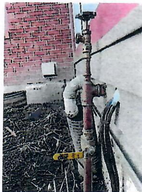
Ball Valve CLOSED